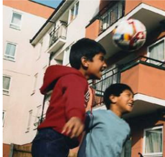
Poplar HARCA: A 'guide neighbourhood' anchoring the management of over 5000 homes and services to 46000 people

The term 'community anchor' refers to the idea that a strong, independent community organisation may have both management capacity and democratic legitimacy. Its core activity may be (for example) housing, leisure or community centre management. However this capacity can be transferred beyond the core activity to support a range of neighbourhood services, either directly provided by the organisation itself or provided by partners associating themselves with this 'anchoring' capacity. Community anchors may start out as resident-led housing providers, development trusts, faith groups etc, but grow beyond this core mission to become more comprehensive neighbourhood service organisations, with extensive professional staffing, while retaining their community base and accountability.