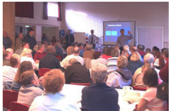
A community committee meeting in Salford