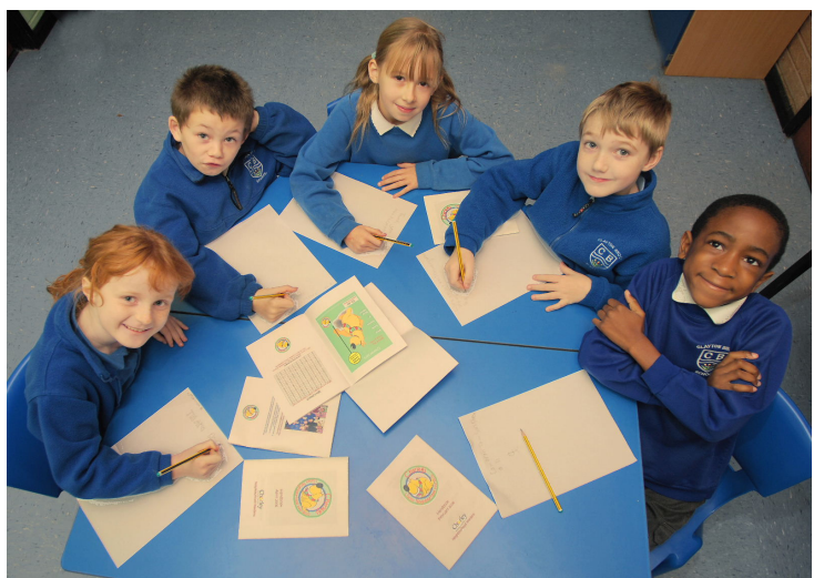
Junior wardens: Neighbourhood working in Chorley is already building tomorrow's active citizens

Typically, neighbourhood working means winning the co-operation of a range of service providers including police and related community safety teams, environmental and streetscene services, highways, social housing managers, youth and leisure services, education providers, health and possibly social services. The approach is intended to co-ordinate (‘join-up’) resources and service delivery to ensure that those problems often seen as most affecting quality of life in a neighbourhood – for example poorly managed and maintained open space, anti social behaviour, minor disorder and damage – are addressed by bringing the activities of a range of