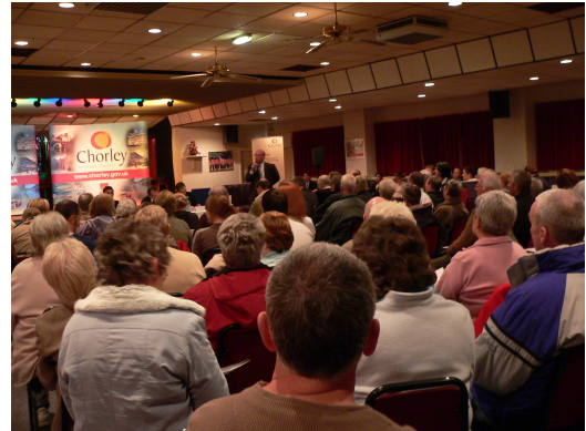
Area Forum pilots attracted large numbers to meetings

Three fairly small areas were recently selected to benefit from Area Forums run on a pilot basis. These consisted of public meetings of committees made up of councillors elected from within the area, plus co-opted members representing partner agencies. They provided an opportunity for the public to raise issues, hold public services accountable and receive a response to questions raised; and for service providers to report on plans, concerns and prospects. This experience is currently being evaluated. The experience is felt to have shown value in making service providers accountable to the public and promoting face to face dialogue on issues. The leisure directorate found great value in using the Area Forums to identify key problems and promote immediate follow up engaging parish councils and community activists in developing early solutions. The council may decide to continue the experiment or to roll out Area Forums on a sustained, district wide basis.