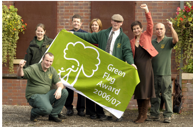
Environmental betterment: one foundation for neighbourhood working

The council's Environment Streetscene and Neighbourhoods directorate is committed to developing neighbourhood working, especially to align its work with community priorities in carrying out cleansing and the maintenance of public space, and to promote public satisfaction with services. The directorate has experience of managing neighbourhood wardens. If these are phased out, additional Police Community Support Officers (PCSOs) will to some extent replace the warden service operating within the police